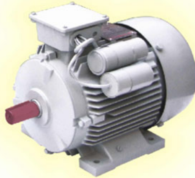
(Cast Iron Body)