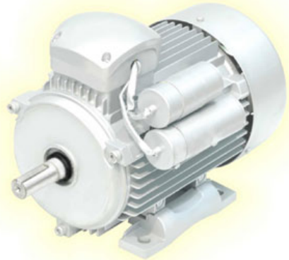
( Aluminium Die Cast Body)